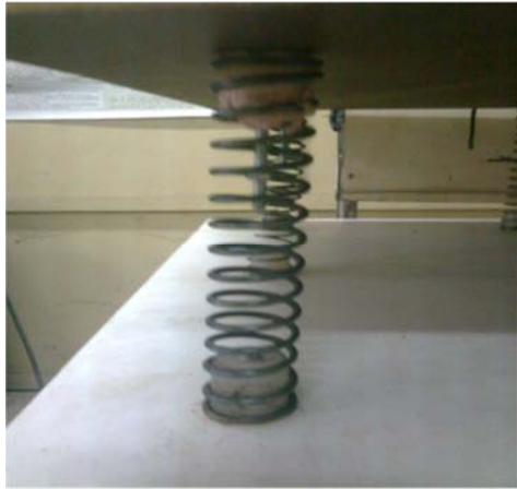
Figure 3. Spring column of model frame.