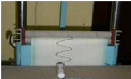
Figure 5. Data recording system of Shaking table.