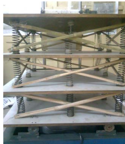
Figure 8. Frame system with bamboo stick bracing.