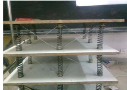
Figure 7. Frame system with G. I wire bracing.