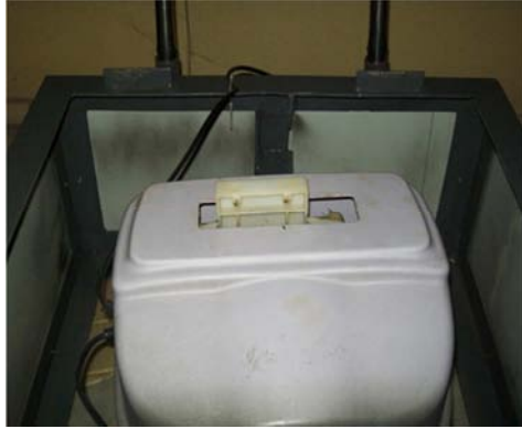
Figure 2. Motor used in shaking table.

the diameters of the driving and driven pulley. This way, provisions have been made for the model to be vibrated at three different frequencies; i.e., 30, 70 and 110 rpm. A marker can be attached to each floor allowing the displacement to be recorder on a suitable white board or a moving graph paper placed in front of it.