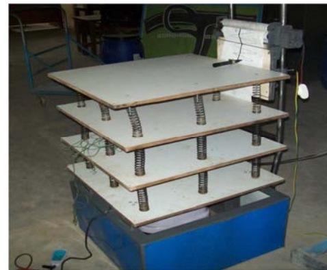
Figure 1. A Typical view of our Shaking Table.