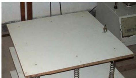
Figure 4. Slab of model frame.