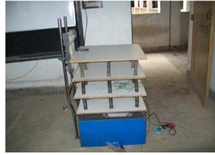
Figure 6. Normal frame system.

Once the paper starts rolling it can record the motions of any floor as it vibrates with time, the motion being recorded by the marker set at the floor level.